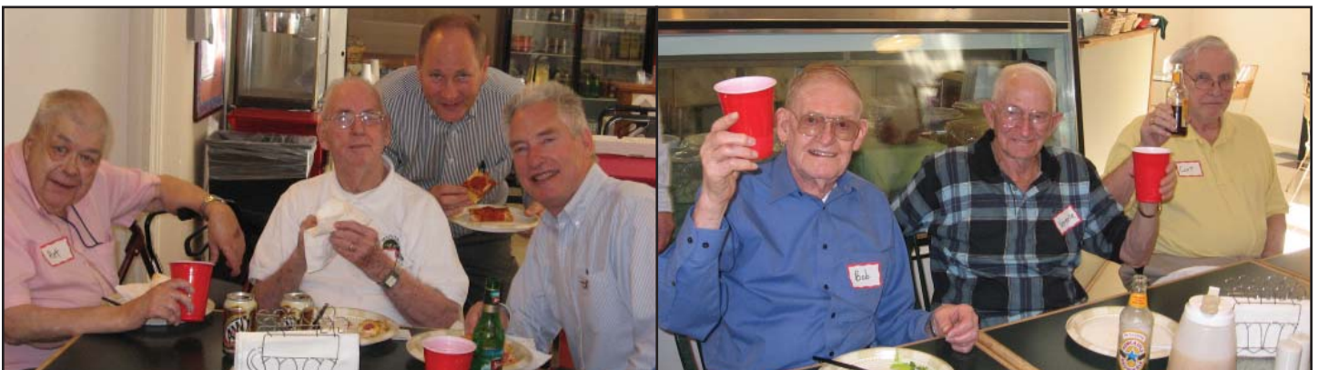
Waterford men gather for pizza, imported beers, and good conversation.

The gatherings are planned throughout the summer. All Waterford men are welcome. ■